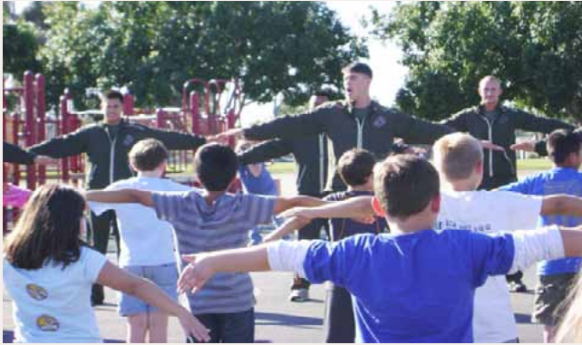
Marines lead children in exercise at a MISSION: READINESS news event in San Diego.

The Pentagon spends $4.5 billion a year on food services. In the most sweeping changes of military food services in 20 years, the Armed Services are bringing healthier foods with more fruits, vegetables, whole grains and lower-fat offerings to dining facilities, Department of Defense (DOD) schools, and other places where service members and their families buy food on base, including vending machines and snack bars. 36